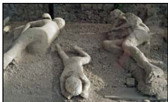
Pompei, 79 AD