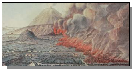
The eruption of Vesuvio in 1760

Contacts : schvoerer@u-bordeaux3.fr or olla_gnier@hotmail.com FER-PACT, 10 Rue Charles Gounod, 33130 Bègles, France. Tel : 33 (0)5 57 12 45 46 - Fax : 33 (0)5 57 12 45 50